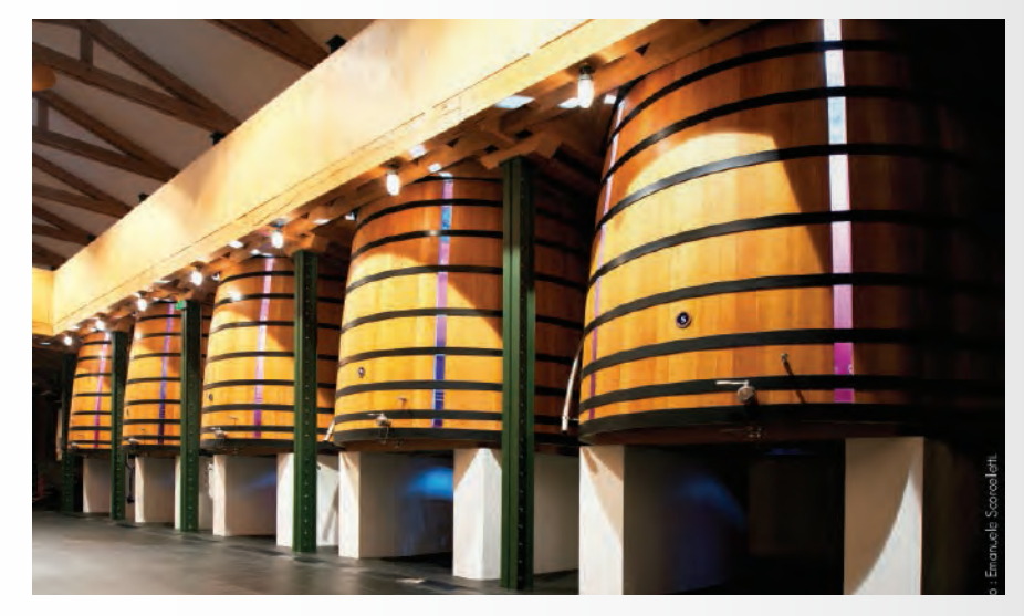
Seguin Moreau created tanks with transparent staves for Château Mouton Rothschild. The see-through staves allow winemakers to view fermentations in action.

"Coopers have been putting Plexiglas heads into barrels for many years," Hansen said. "We and Mouton wanted to do this for upright tanks."